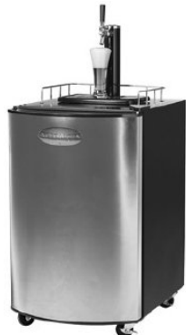
Behold the kegerator.